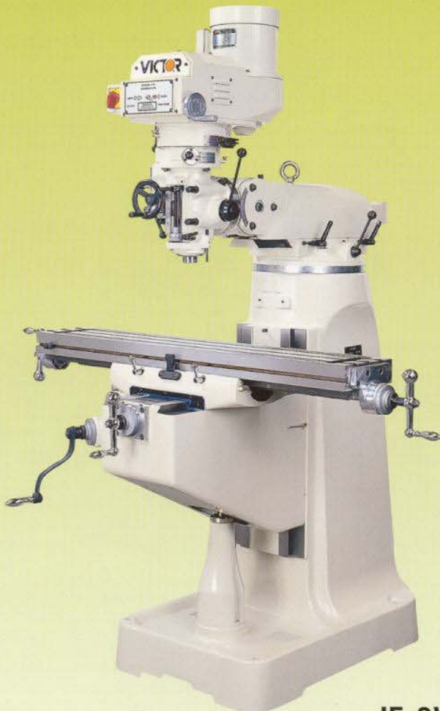
JF-2VS Vertical Turret Mill