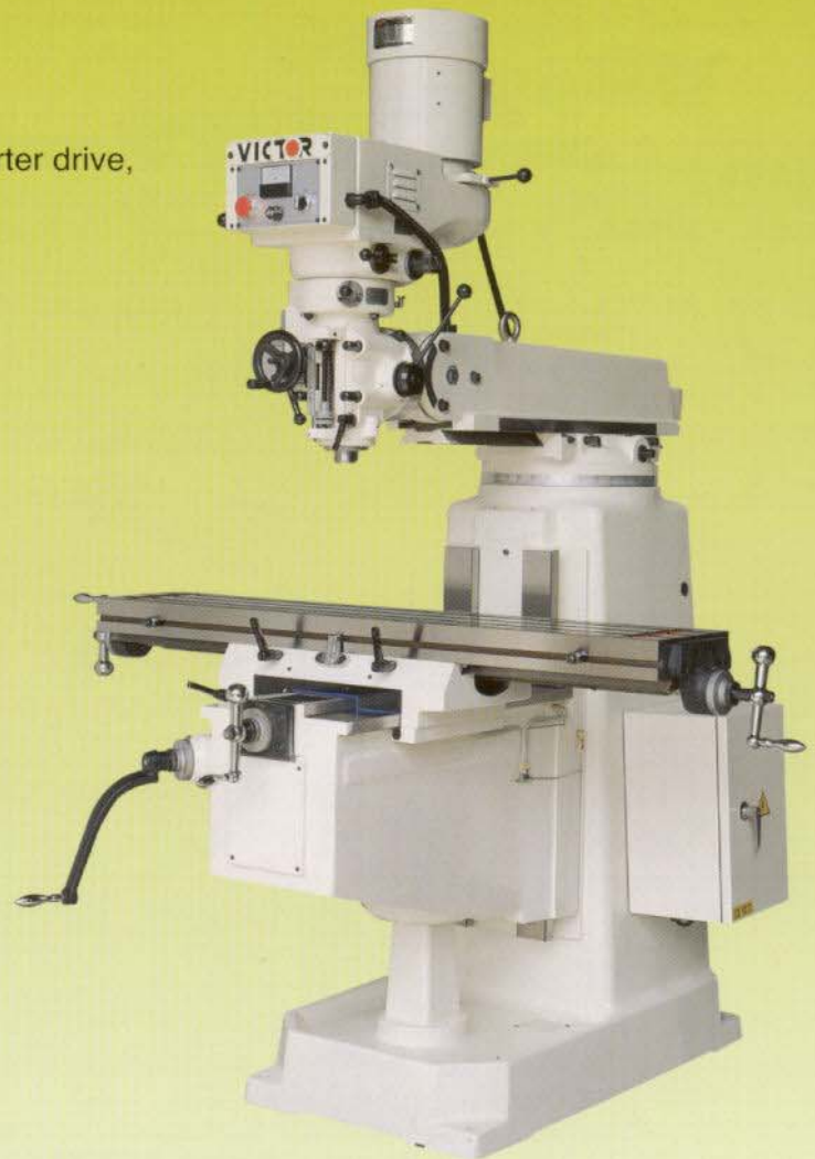
JF-4EVS Electronic Variable Speed Mill